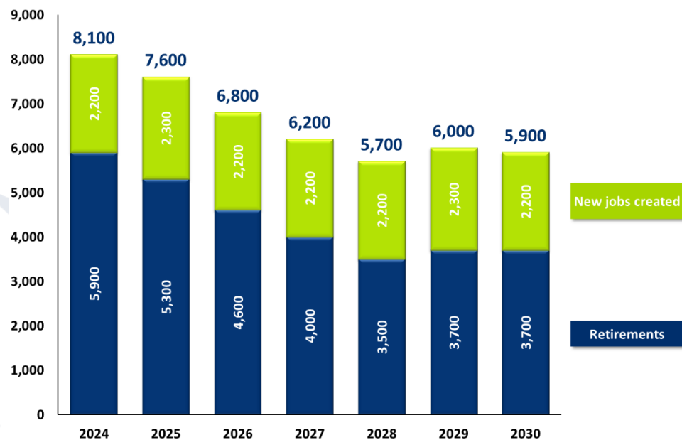
Figure 3: Number of new people required by the sector – by cause and year

2.1.3 Of the 46,400 new people required by the sector by 2030, 78% of them (36,500 people) will initially be working at RQF level 3 or below.